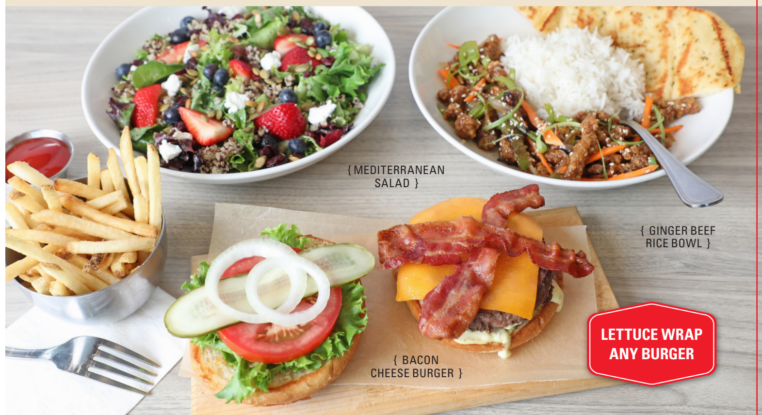
{ MEDITERRANEAN SALAD }

Two warm flour tortillas filled with Cajun blackened chicken, fresh house-made pico de gallo, shredded lettuce, then drizzled with chipotle aioli. 17 49