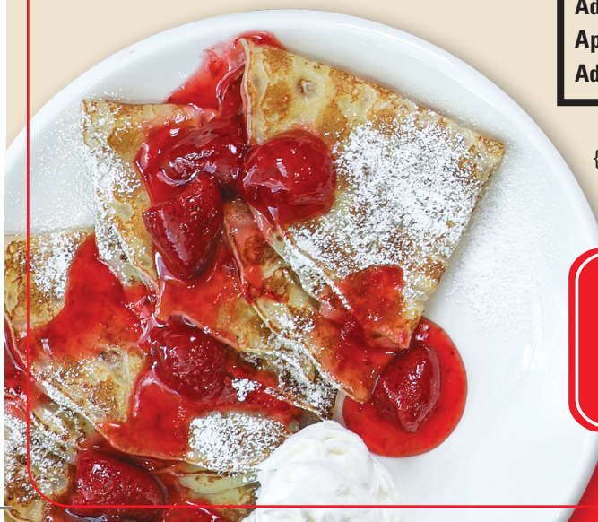
{ STRAWBERRY CRÊPES }