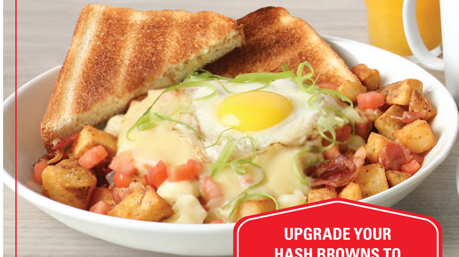
{ ULTIMATE BREAKFAST BOWL }

UPGRADE YOUR HASH BROWNS TO BREAKFAST POUTINE FOR ONLY $2.99